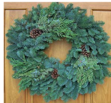
26" Decorated Wreath